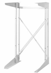
49971 Optional Stack Stand Kit Used to stack the compact dryer onto the compact washer.