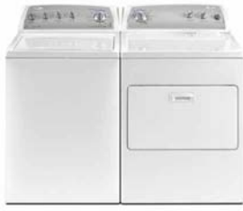
WTW4900AW Whirlpool® 3.6 cu. ft. Traditional Top Load Washer with H2Low™ Wash System