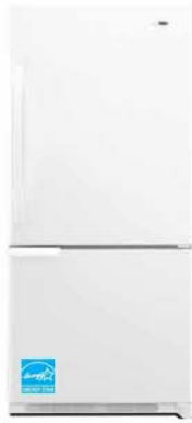
ABB1921WEW Bottom-Freezer Refrigerator

Also available in Stainless Steel - AFD2535FES