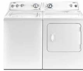
WTW4800XQ 3.4 cu. ft. Top Load Washer