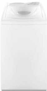
LCE4332PQ 2.1 cu. ft. Compact Top Load Washer