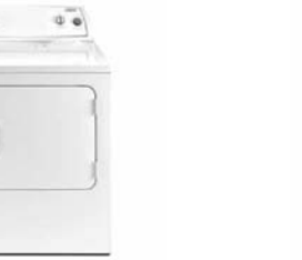
WED4800XQ Whirlpool® Traditional Electric Dryer with AutoDry™ System