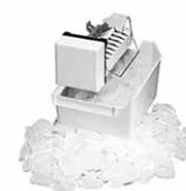
ICE MAKER Part # ECKMF94 Automatic Ice Maker Kit

● A - Monochromatic Satina ● B - Black ● D - Natural Silver ● L - Lunar Silver ● M - Monochromatic Stainless Steel ○ Q - Monochromatic White ● S - Stainless Steel ● T - Biscuit ○ W - Silver Metallic / Chrome on White