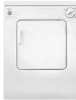
LDR3822PQ Compact Electric Dryer with AccuDry™ Drying System