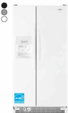
ED5KVEXVB, L, Q 25 cu. ft. Side-by-Side Refrigerator