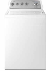
WTW4880AW Whirlpool® 3.4 cu. ft. Top Load Washer with ENERGY STAR® Qualification