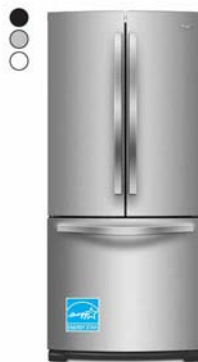
WRF560SFYW, B, M 30" French Door Bottom Mount Refrigerator