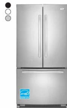
GX5FHDXVA, Q, T, Y Whirlpool Gold® 25 cu. ft. French Door Bottom Mount Refrigerator