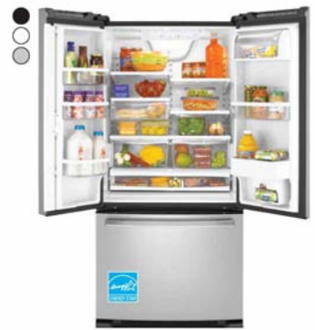
GX2FHDXVA, B, D, Q, T, Y Whirlpool Gold® 22 cu. ft. French Door Bottom Mount Refrigerator