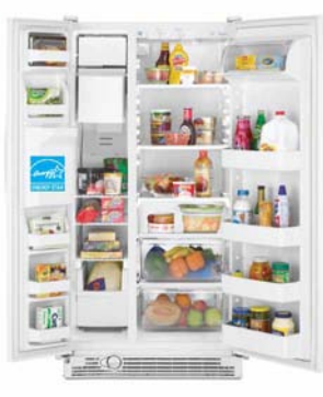
ED2KVEXVB, L, Q 22 cu. ft. Side-by-Side Refrigerator