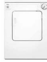
LER3622PQ Compact Electric Dryer with End of Cycle Signal