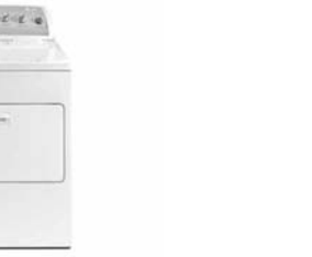
WED4900XW Whirlpool® Traditional Electric Dryer with AccuDry™ Drying System